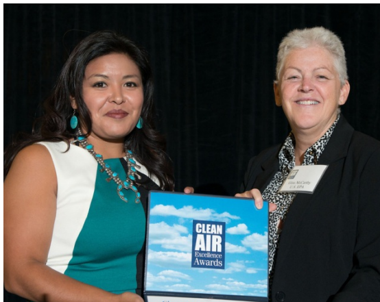
Photo: Spokane Tribal Air Quality Coordinator and InnerTribal Beat Host, accepting a 2012 EPA Clean Air Excellence Award in Washington DC from Gina McCarthy, EPA Assistant Administrator for the Office of Air and Radiation.